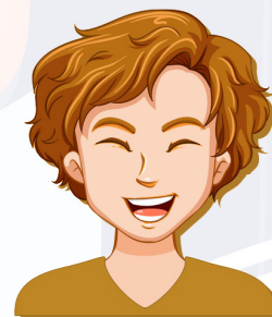
Relief after taking Montegur LC